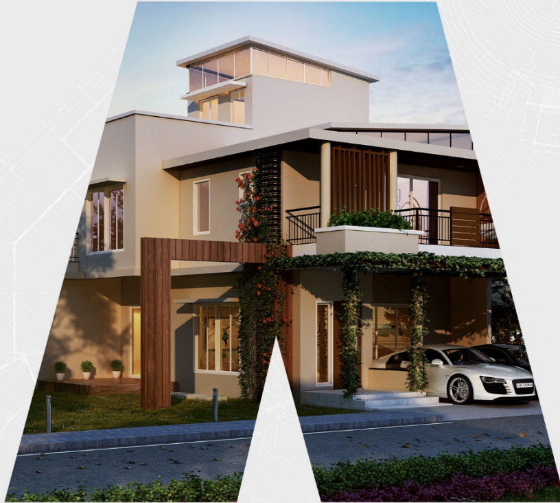
A PURAVANKARA HOME AT THE SOUND OF WATER